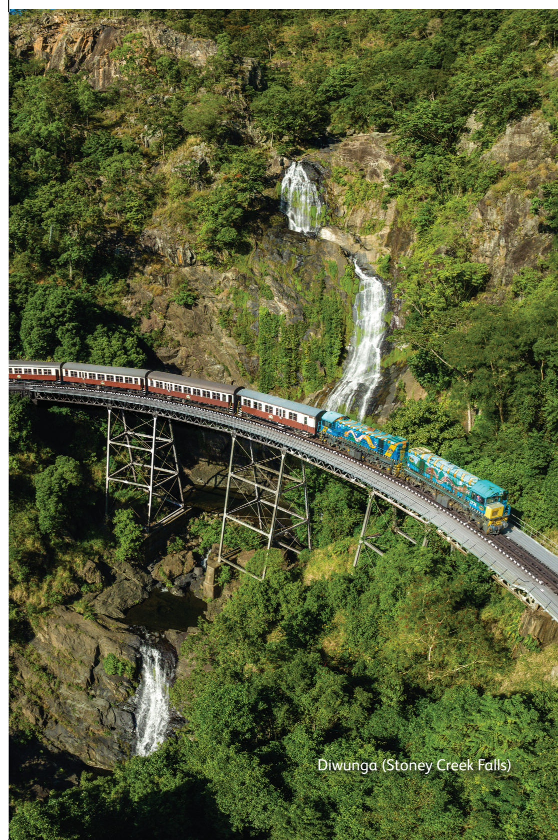
Diwunga (Stoney Creek Falls)