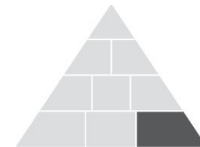
Photo / Film Consent Form

I _____ (Your contact details are for record keeping purposes only and will not be published)